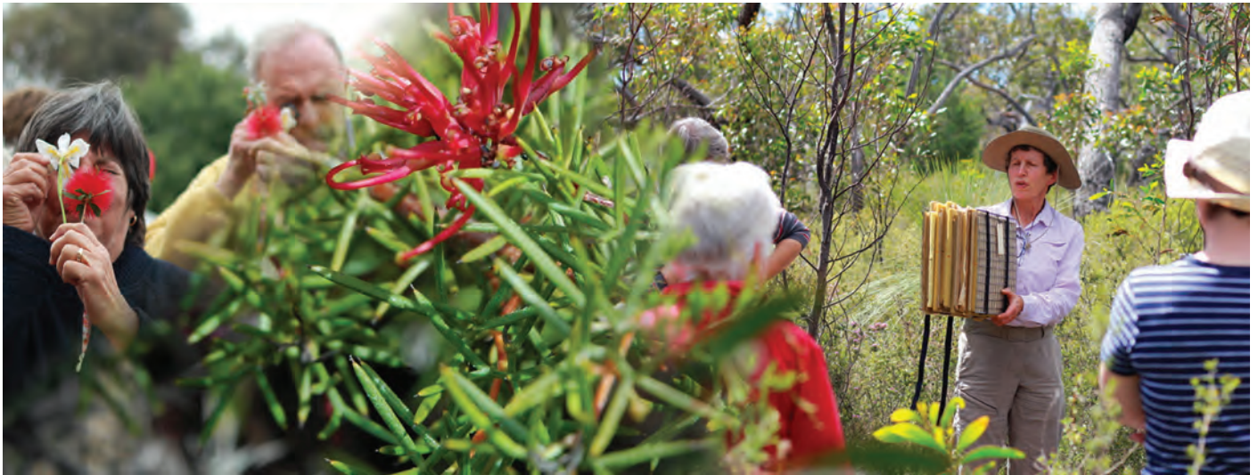
Participants at the Wimmera plant identification workshop in 2013. Photo: T. Hogbin | Endangered plant Grevillea acropogon . Photo: A. Cochrane | Botanist Isobel Crawford demonstrating how to collect a specimen at the Wimmera plant identification workshop. Photo: T. Hogbin

The ANPC has over two decades of experience in presenting training courses and bringing the best science and practical experience together in a form accessible to on-ground practitioners.