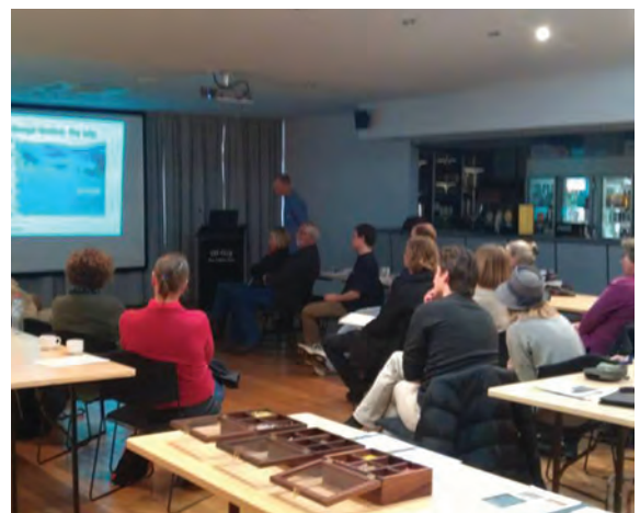
Participants at the 2015 Yass Provenance Workshop.