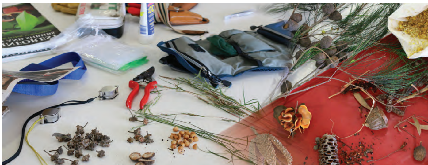
Materials and tools at an ANPC seed collection, storage and use workshop.