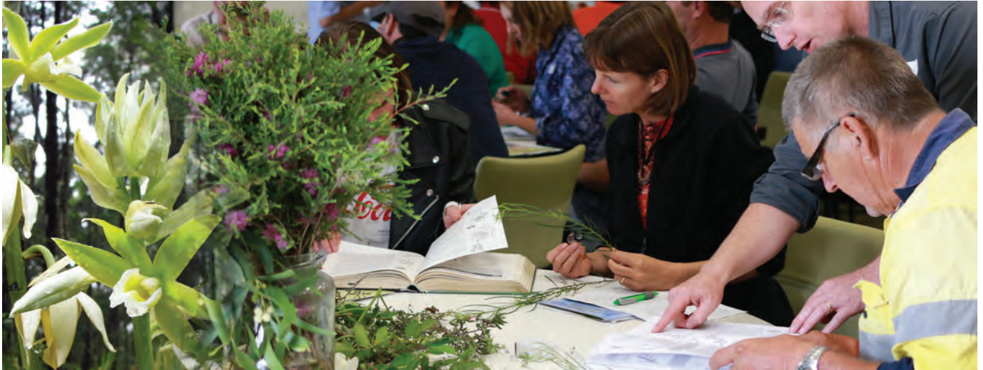
The endangered Swamp Orchid (Phaius bernaysii). | Participants at the Hunter plant identification workshop in 2014.