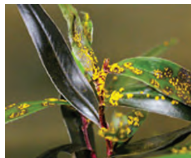
Myrtle Rust pustules and spore masses on Agonis flexuosa (willow myrtle) cv. 'Afterdark'.