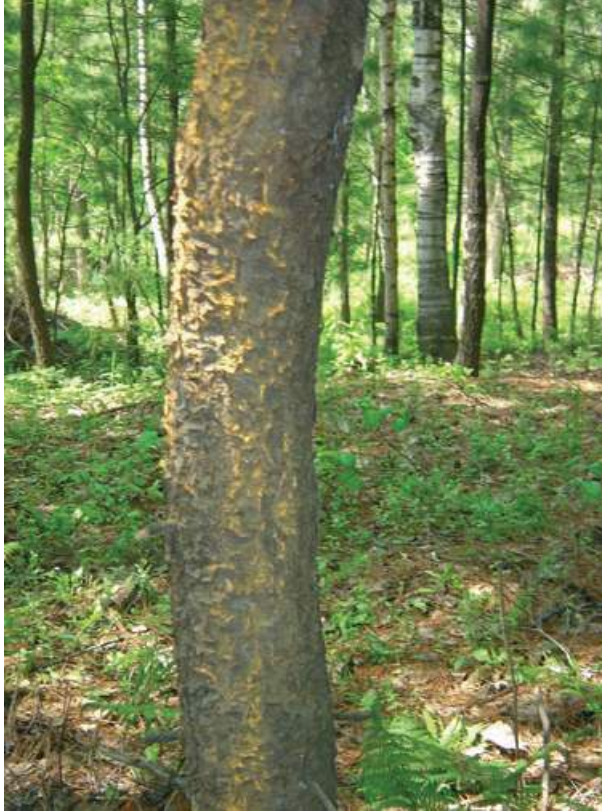
Fig. 2. Pinus koraiensis in northeastern China with large blister rust canker caused by an active infection of Cronartium ribicola . Such a large area of sporulation may not be typical of C. ribicola , but it opens a question whether this might actually indicate host tolerance whereby sporulation develops near the surface of the inner bark (phloem).