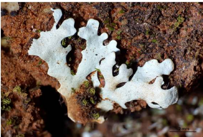
Xanthoparmelia sp., a member of the foliose lichen morphogroup.